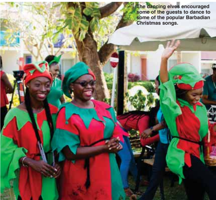
The dancing elves encouraged some of the guests to dance to some of the popular Barbadian Christmas songs.