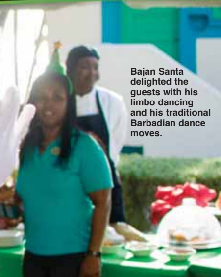
Bajan Santa delighted the guests with his limbo dancing and his traditional Barbadian dance moves.